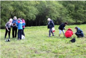
May: Plant ID at Hillfort