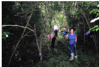
August: Inner Island clearance