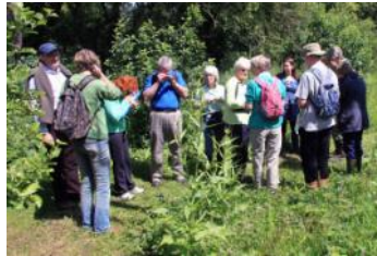
July: Lichen and Moss survey