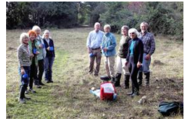
September: Open sightlines at Hillfort