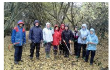
November: Hillfort orchard clearance