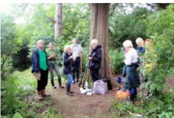
July: Path clearance at Hillfort