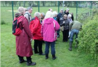
June: Nature Walk at Hillfort