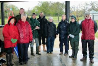
June: Plant ID at Putnoe Wood