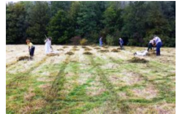
September: Raking Meadow