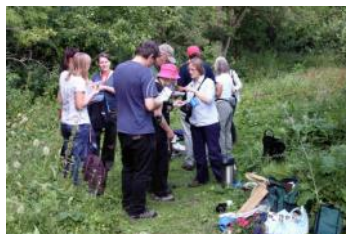
August: Lichen survey at Hillfort