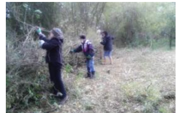
October: Hillfort scrub clearance