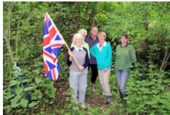
August: Expedition to Inner Island